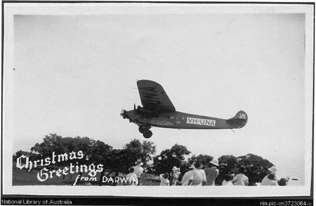
National Library of Australia

Hobart - Melbourne - Sydney - Brisbane - Longreach - Camooweal - Kupang -Surabaya - Batavia - Singapore - Alor Setar - Rangoon - Calcutta - Allahabad - Jodpur - Karachi - Jask - Bushehr - Baghdad - Aleppo - Athens - Rome - Lyons - London.